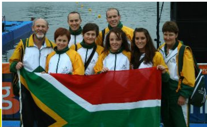
Gauteng North athletes held the SA flag high in Hamburg !