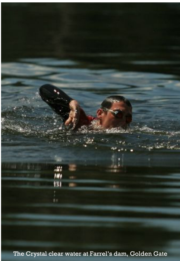
The Crystal clear water at Farrel's dam, Golden Gate